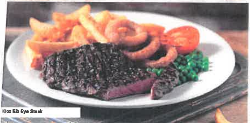
10oz Rib Eye Steak