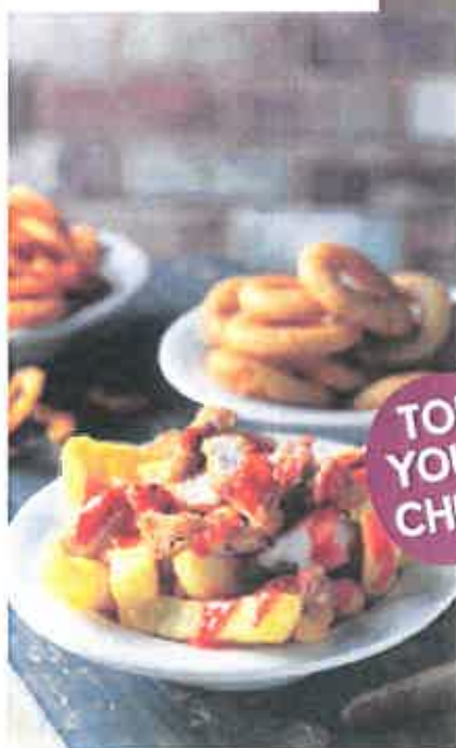
Buffalo Buttermilk Chicken Topped Chips, Onion rings & Curly Fries

If you have a food allergy please let us know before ordering. Full allergy information is available at the bar or visit allergies.marstons.co.uk