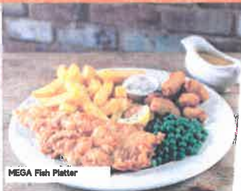
MEGA Fish Platter