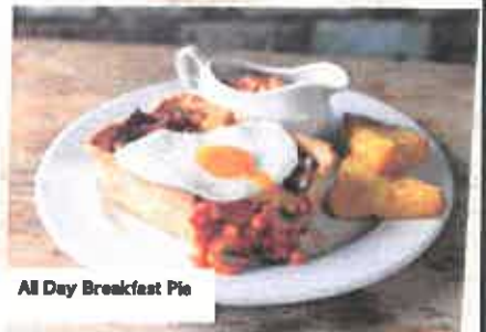
All Day Breakfast Pie

Chicken breast and gammon in a creamy Dijon and wholegrain mustard sauce, topped with a puff pastry lid. Served with chips, garden peas and gravy.